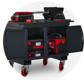
Mobile TuffBench MBH12