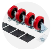
Castor kit CAS160HD-KS-SW-SB-CP