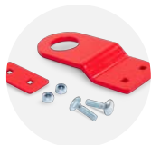
Anchor kit IGA1