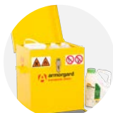
TransBank Chem TRB2C