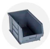
Fittings bins FCB