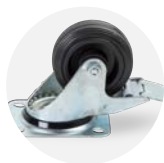
Castor Kit CASS6