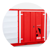
Forma-Stor COSHH FR400-C