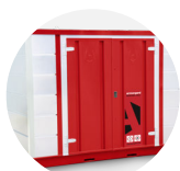
Forma-Stor COSHH FR300-C