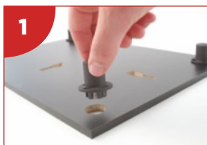
1 Push metal button into black studs, then insert black studs into back of board.