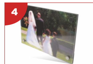
4 Finished - ready to display!