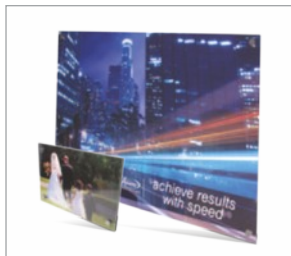
Huge range of sizes from A4 to 24 x 36".