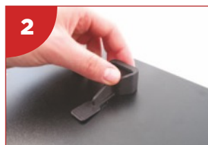
2 Clip the hanger in place, portrait or landscape.