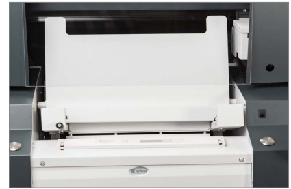
New Sesame system for better access to the book block

Product information as of June 2024 and is subject to change without notice