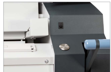
Constant quality: only push the button.