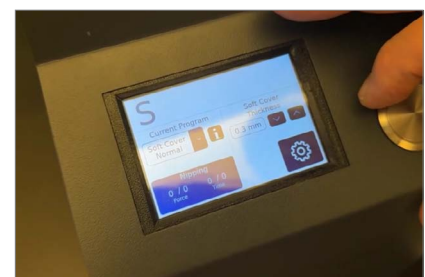
Intuitive touch screen control panel

Manufacturer: Fastbind Co P.O.BOX 10, 2601 Espoo, FINLAND Tel: +358 10 3254 600 info@fastbind.com • www.fastbind.com