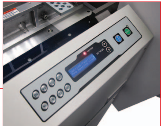
Clear and easy digital control panel.