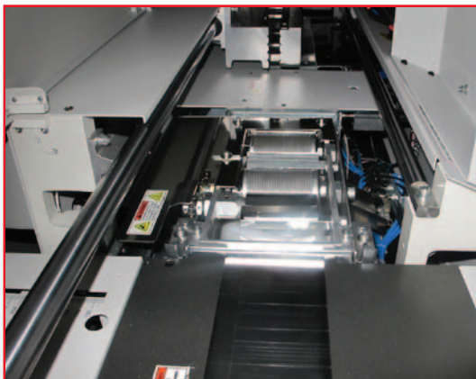
Infinitely adjustable air operated nipper table for a 'perfect' book every time.

All of this means the DB320Pro is an economical, easy to set up, fast, single operator perfect binder that produces similar results to PUR binders on the majority of stocks. Any digital printer looking to offer perfect binding should consider this stand alone, stand out machine.