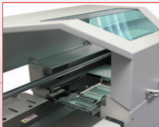
Protective cover protects and also allows clear visibility.