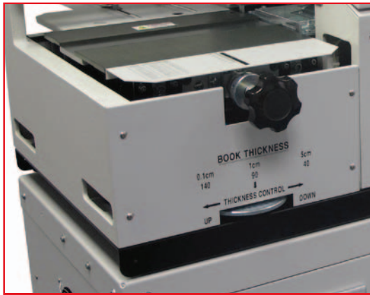
Easy and accurate book thickness adjustment from 2 - 50mm.