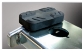
Rubberised Lifting Pad