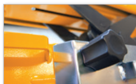
High Quality Finish