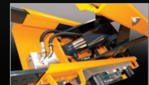
Manual or Pneumatic Operation