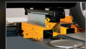
Load Capacity from 2.0 tonne