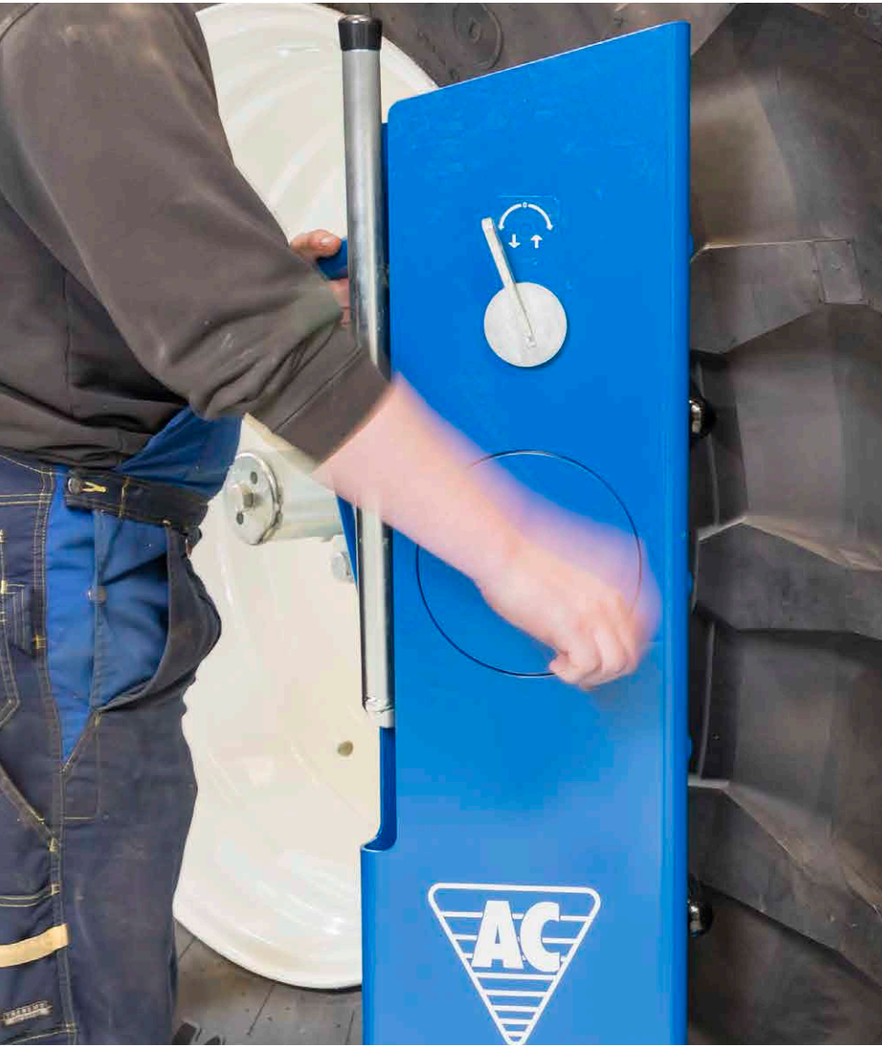
Rotate the wheel to align the studs perfectly when re-fitting the wheel