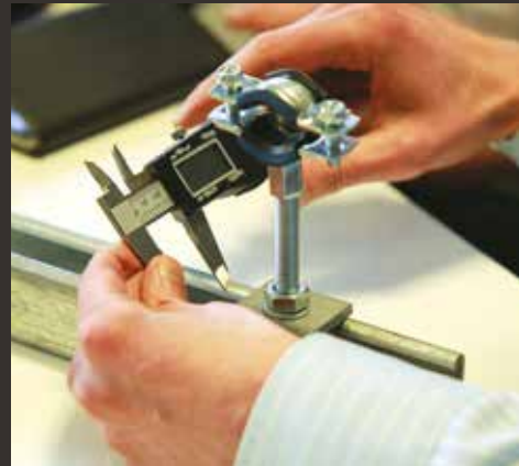
FSC Hardware Blocks