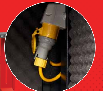
X3 110V POWER OUTLET