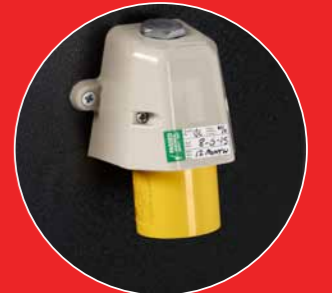
X1 110V POWER INLET SUPPLY