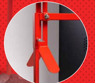
EXTENDING SUPPORT ARMS