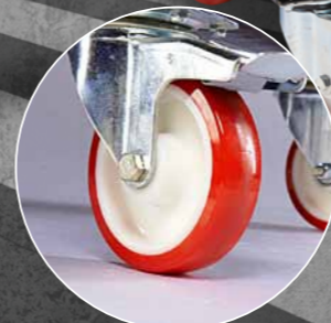
HEAVY-DUTY ALL SWIVEL WHEELS