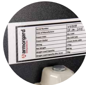
STICKER OF CONFORMITY

Discover more about the Armorgard CuttingStation™ at www.fixmart.co.uk or speak with an expert team member on 01322 274226