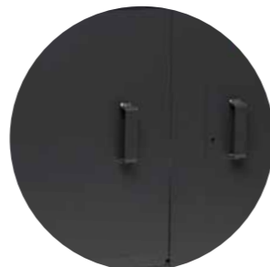
SECURE LOCKABLE CABINET