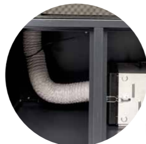
OPTIONAL DUST EXTRACTION OR AIR FILTRATION SYSTEM