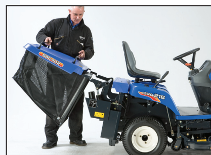
Easy remove collector (all models supplied with ROPS)