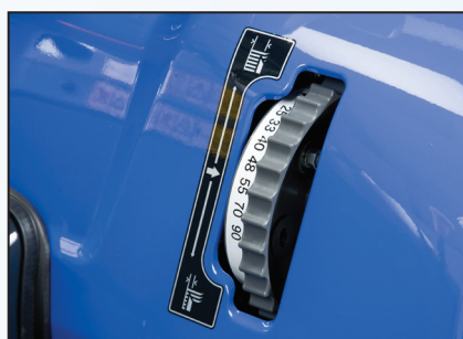
"Dial-in" cutting height adjustment