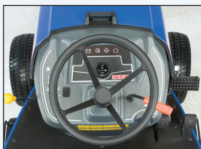
Easy operation and comfort for long-term use