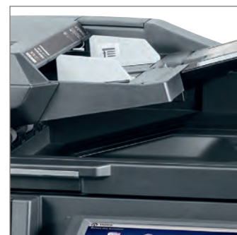
Choice of three document feeders: 50 sheets / 100 sheets / 175 sheets with single-pass Dual-Scan