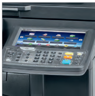
Easy to use colour touch panel