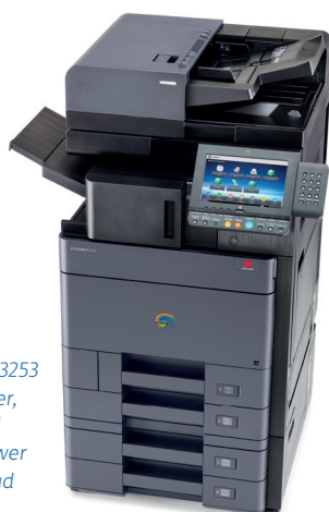
d-Color MF2553 / d-Color MF3253 with DF-7100 Internal Finisher, DP-7110 Single-pass Original Feeder, PF-7100 Double Drawer and NK-7100 Numeric Keypad