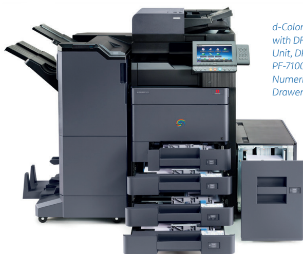
d-Color MF2553 / d-Color MF3253 with DF-7110 Finisher, BF-730 Folding Unit, DP-7100 Original Feeder, PF-7100 Double Drawer, NK-7100 Numeric Keypad, and PF-7120 Side Drawer