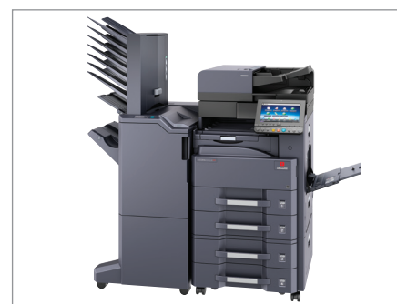
d-Copia 3502MFPlus full configuration