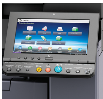
9" Colour Touch Panel display