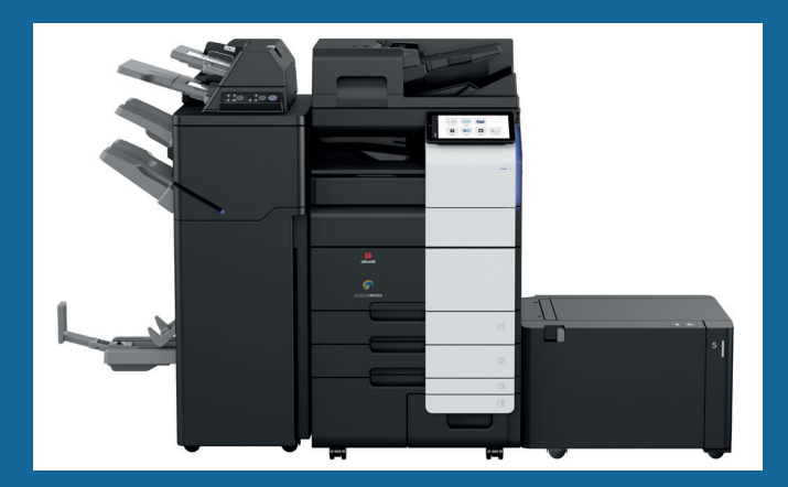
Configuration with Finisher FS-540SD, with Post-inserter PI-507 and connection unit RU-513, Side Drawer LU-207