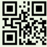
Combe Martin 01271 889031

To ring one of these centres please scan the relevant code