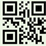
Lynton 01598 752225