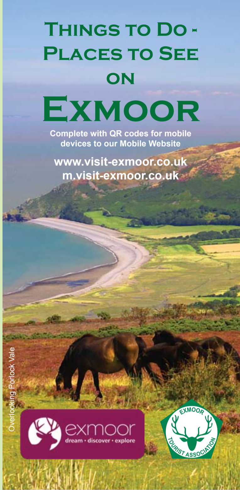
Overlooking Portlock Vale