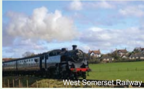
West Somerset Railway

Children can enjoy the Dinosaur Park and Watermouth Castle either side of Combe Martin. Just up the road is Exmoor Zoo where you can discover the Exmoor Beast among other animals. See our amazing coastline from the sea on boat trips from Watchet, Minehead, Lynmouth and Ilfracombe and be up close to the seals and dolphins.