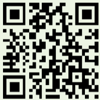
Picnic Spot pages

Find a wide choice of ideal picnic spots on our website. Compiled by our walking festival organiser, he recommends various sites in Exmoor and The Quantocks. All have grassy areas, some near pubs or cafes, some with toilets, some by rivers or wide open views. All have directions to help find them.