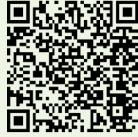
Food & Drink pages

With such a marvellous choice of local produce providing beef, lamb, cheeses, clotted cream, ciders and even wine, you don't have to go far to find some excellent fare. There are farmers' markets in most of the bigger towns, some every week, some once a month. Our website lists them or ask at the visitor centres. You will find some excellent restaurants and cafes in villages and towns around the moor.