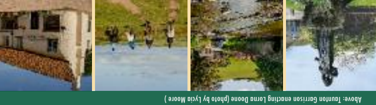
Above: Tenthon Garrison embracing Lorna Doone